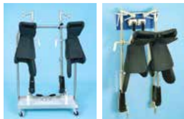
Organize your accessories with the Stirrup Dolly (left) and Stirrup Wall Rack (right).